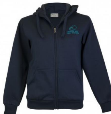
jacket zip hoodie