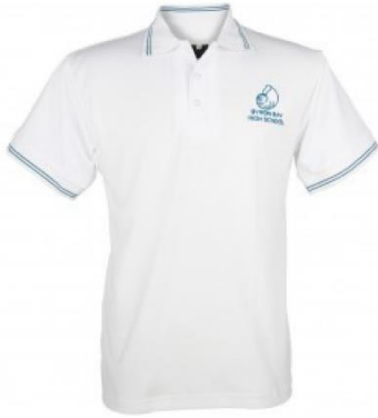
polo everyday white shirt

https://theschoollocker.com.au/schools/byron-bay-high-school/byron-bay-high-school-uniforms