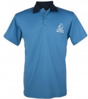
polo sport teal