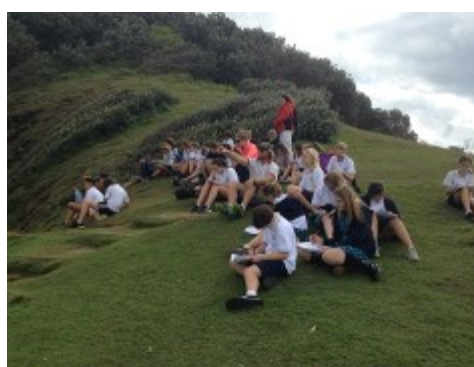
Mr Larsson identifying some of the features of the landscape that the students included on their field sketches.