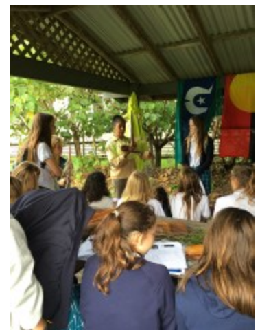
Delta's presentation involved plenty of chance for the students to get some hands on experience.