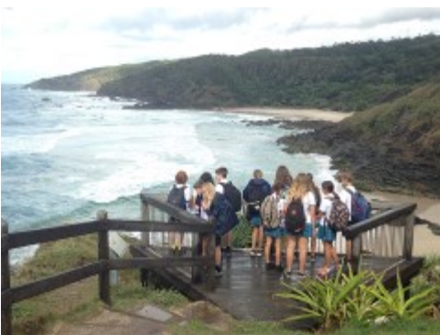
Students finding out about the history of the area and the importance of the Pandanus Trees as a food source.